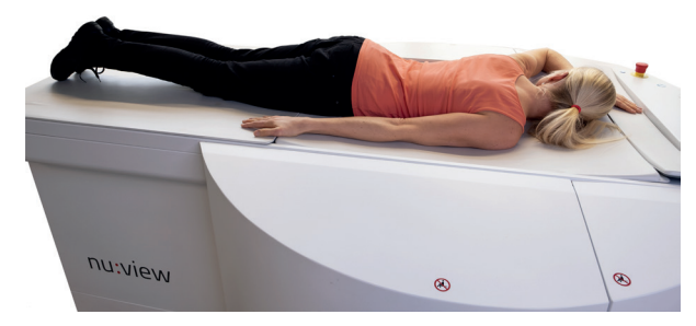
The nu:view Mamma-CT system was developed and is produced by the German company AB-CT - Advanced Breast CT. The design of the new scanner allows compression-free imaging of one breast at a time. To do this, the breast CT system uses a rotating gantry on which the X-ray tube and photon-counting detector are mounted. During the image acquisition process, the gantry rotates around the breast in a downwards-oriented spiral trajectory. In the course of a single scan up to 12,000 projection images are acquired. A full spiral scan takes as little as 7 - 12 seconds.

Of all our imaging modalities, mammography was in fact the last to go digital with the acquisition in 2000 of our digital Mammo-System (Siemens CR-System). Since then we have continuously updated and have become a reference-site for Siemens over the last 20 years. Thus, we were the second site world-wide to install digital breast tomosynthesis and were the first clinical practice to implement Contrast-Enhanced Mammography (CEM) a few years ago and, more recently, the titanium-filtered variant of CEM (Ti-CEM). However we are not wedded to any one specific vendor – for example, the four MRI systems in my practice in Dortmund are from Phillips.